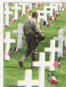
A World War II enthusiast dressed in combat uniform walks in the American cemetery in Normandy, France.

NEWSDAY, SATURDAY, JUNE 6, 2009 www.newsday.com